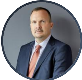
JOHN HOWCHIN Secretary-General, Council on Ethics Swedish National Pension Funds